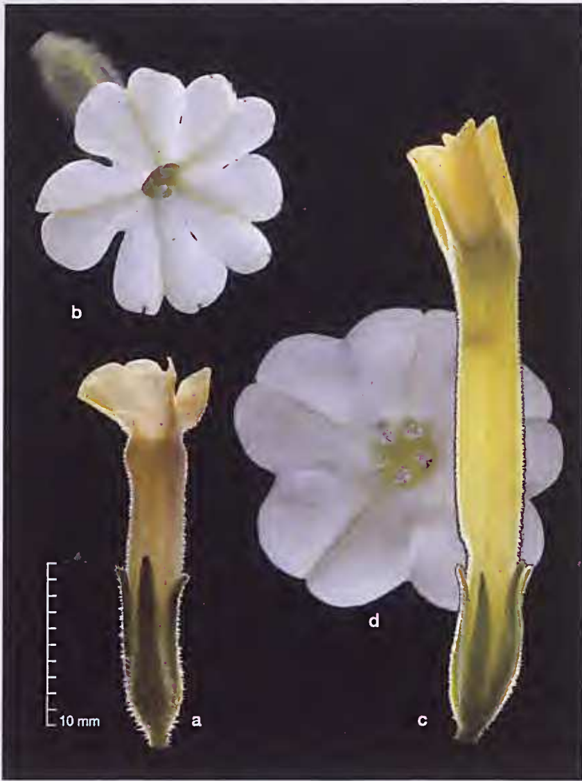
Figure 1. Corolla tube and limb. a., b. Nicotiana maritima , N. Walsh 8477, MEL; c., d. N. 'Cape Schanck' , N.G. Walsh 8476, MEL.